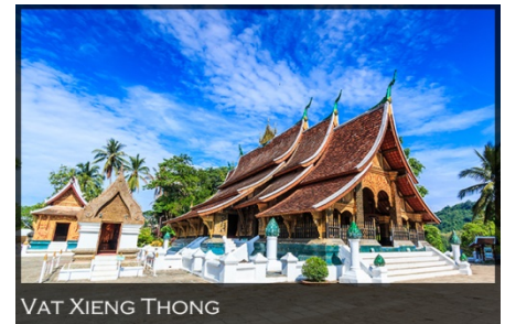
VAT XIENG THONG