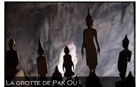
LA GROTTTE DE PAK OU